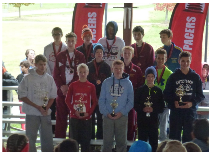
Top 15 male 8th grade runners at Jr Hi XC Race