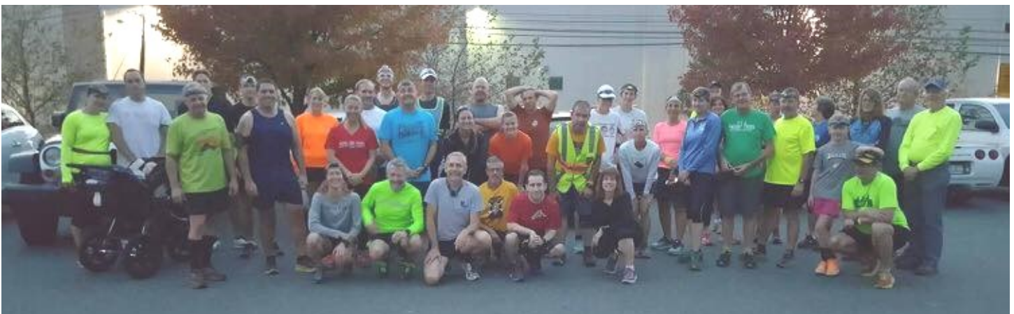
Pacers gather at the Brentwood Trailhead parking lot for the Schuylkill River (Thun) Trail prior to the Wednesday Night Run on November 2.