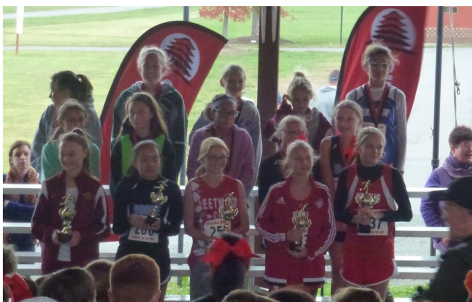
Top 15 female 7th grade runners at Jr Hi XC Race